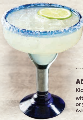
THE PERFECT PATRÓN