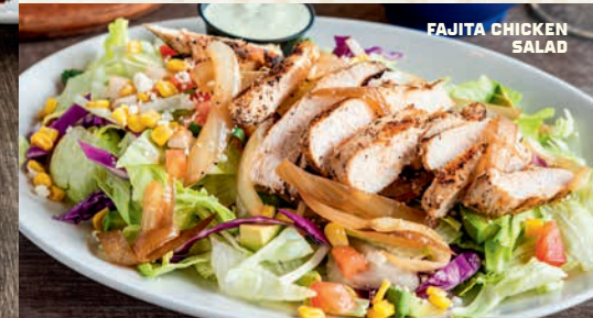
FAJITA CHICKEN SALAD