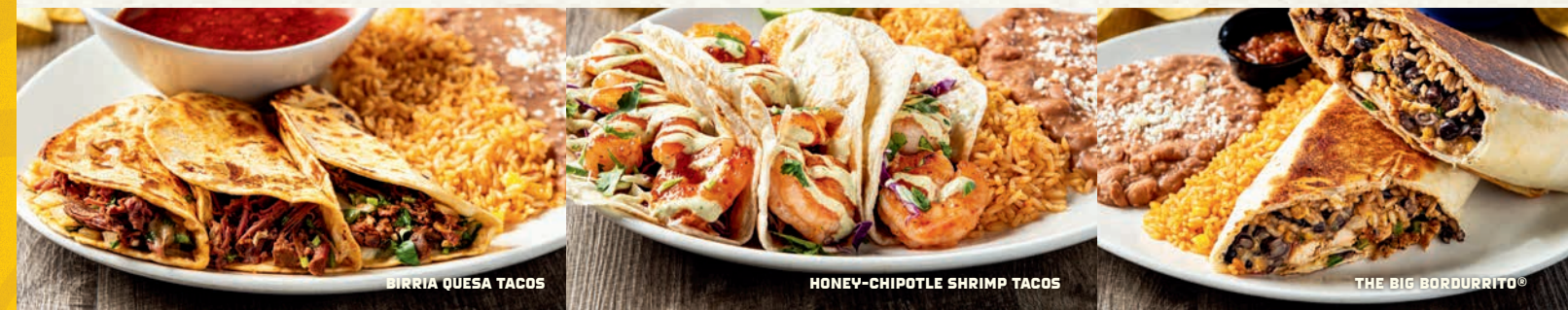
BIRRIA QUESA TACOS

Served with Mexican rice and refried beans, unless otherwise noted. Black beans available upon request. All tacos served in warm, hand-pressed flour tortillas, unless otherwise noted.