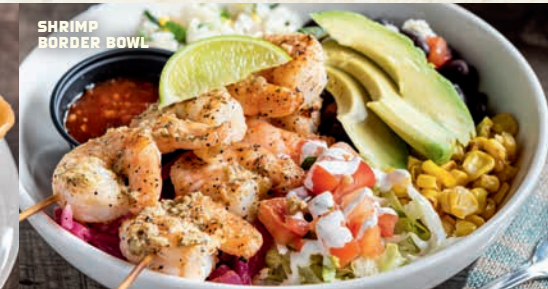
SHRIMP BORDER BOWL