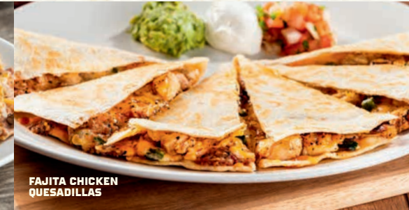
FAJITA CHICKEN QUESADILLAS