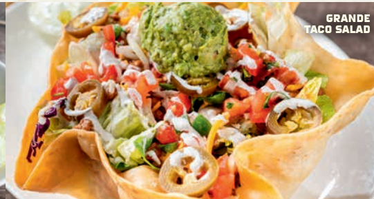
GRANDE TACO SALAD