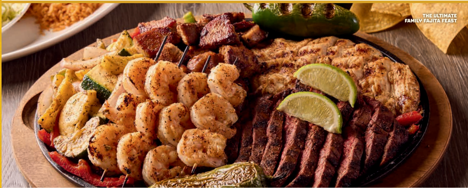
THE ULTIMATE FAMILY FAJITA FEAST

Our NEW mesquite-grilled fajita line-up brings you more. It starts with our NEW premium outside skirt steak, chicken or your choice of protein. More flavor with our NEW blend of spices, more fajita veggies and a grilled jalapeño for an extra kick of spice and flavor!