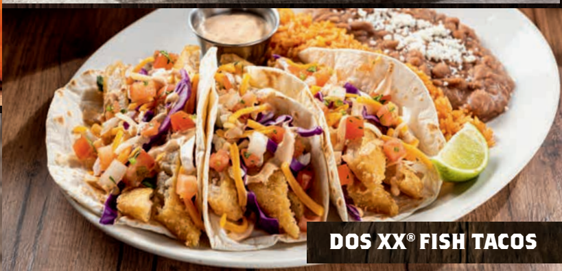
DOS XX® FISH TACOS