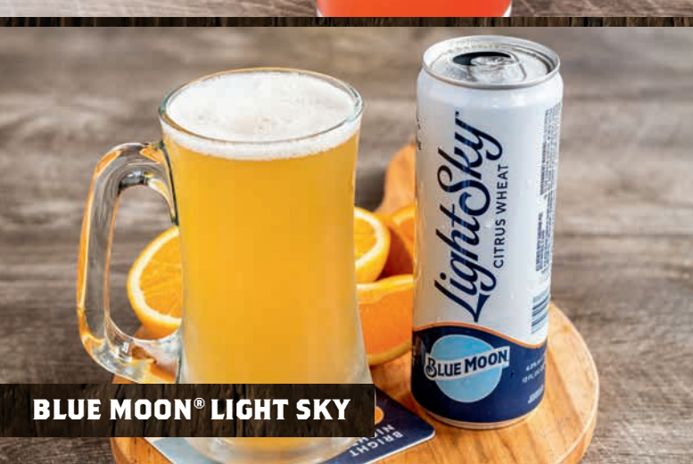
BLUE MOON® LIGHT SKY