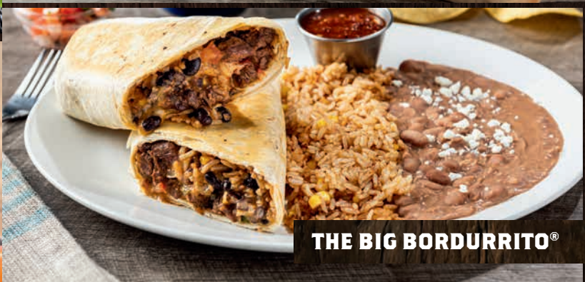
THE BIG BORDURRITO®