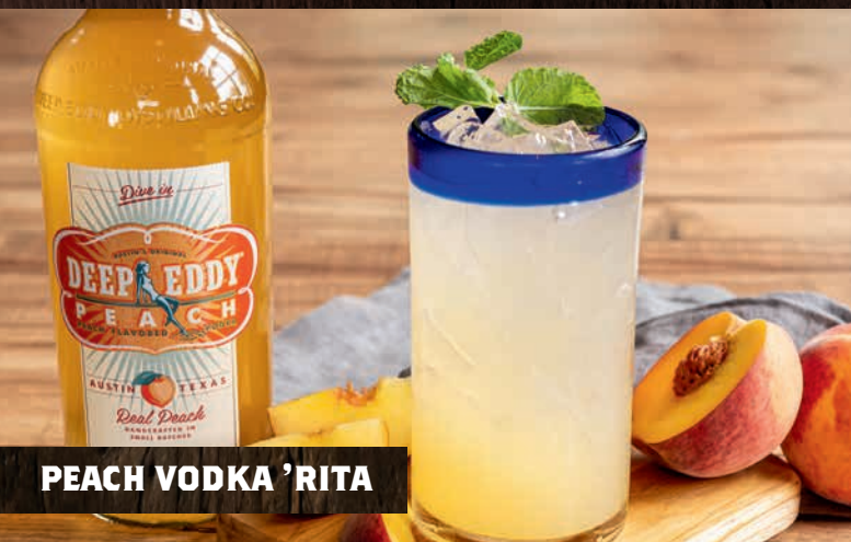
PEACH VODKA 'RITA