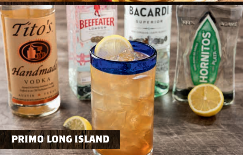
PRIMO LONG ISLAND