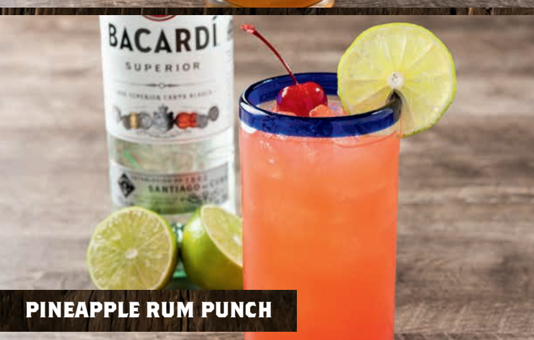
PINEAPPLE RUM PUNCH