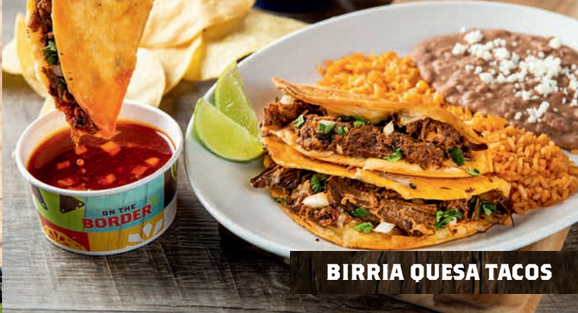
BIRRIA QUESA TACOS