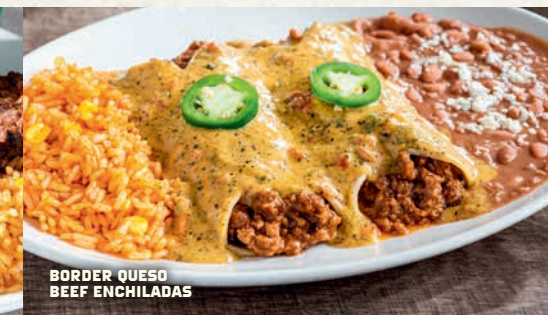
BORDER QUESO BEEF ENCHILADAS

Five of your favorites on one big plate! Cheese quesadilla, chicken tinga enchilada with sour cream sauce, crispy or soft seasoned ground beef taco, chicken flauta and beef empanadas. Served with Mexican rice. 1900/1890 cal | 16.99