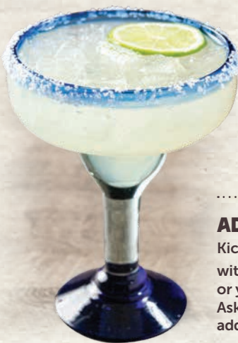
THE PERFECT PATRÓN