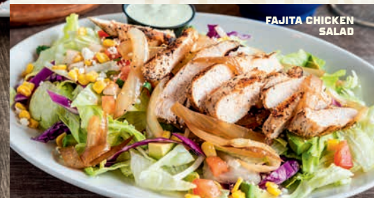
FAJITA CHICKEN SALAD