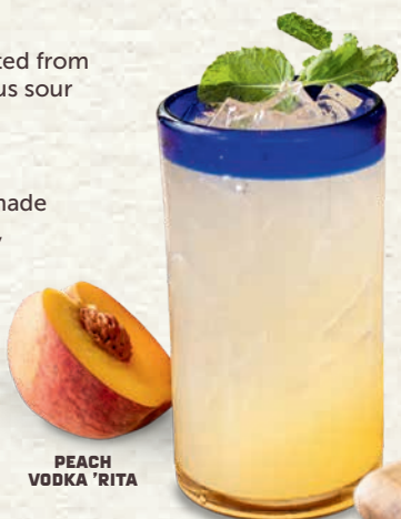
PEACH VODKA 'RITA

Take a trip to the tropics with Bacardí Superior Rum, pineapple juice, fresh lime juice and pure cane sugar. 260 cal | 9.49