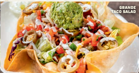
GRANDE TACO SALAD