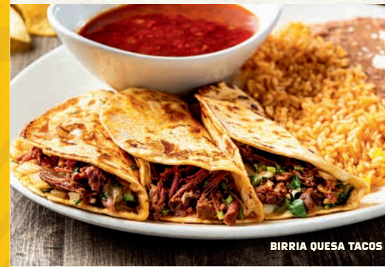
BIRRIA QUESA TACOS

Served with Mexican rice and refried beans, unless otherwise noted. Black beans available upon request. All tacos served in warm, hand-pressed flour tortillas, unless otherwise noted.