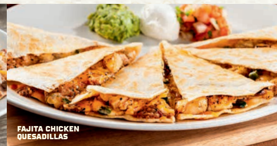
FAJITA CHICKEN QUESADILLAS