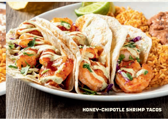
HONEY-CHIPOTLE SHRIMP TACOS

Dos XX beer-battered fish, creamy red chile sauce, shredded cabbage, mixed cheese and pico de gallo. 2) 1490 cal | 13.79 3) 1880 cal | 15.29