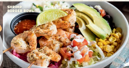
SHRIMP BORDER BOWL