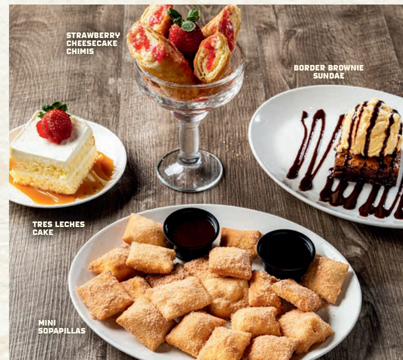
STRAWBERRY CHEESECAKE CHIMIS

Topped with seasoned ground beef, guacamole and sour cream. add 110 cal