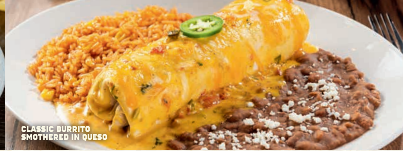
CLASSIC BURRITO SMOTHERED IN QUESO

HALF ORDER With honey or chocolate sauce. 620/590 cal | 3.49