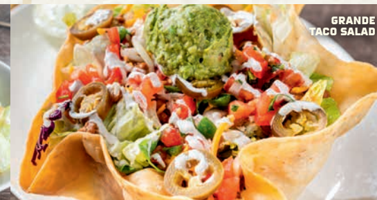
GRANDE TACO SALAD