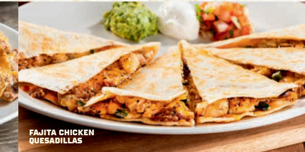
FAJITA CHICKEN QUESADILLAS

Fries smothered in queso and topped with melted Jack cheese, crispy bacon crumbles, spicy avocado ranch and sliced pickled jalapeños. 1310 cal | 10.29