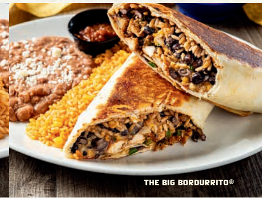
THE BIG BORDURRITO®