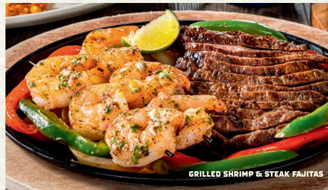
GRILLED SHRIMP & STEAK FAJITAS