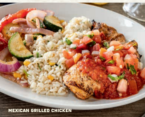
MEXICAN GRILLED CHICKEN