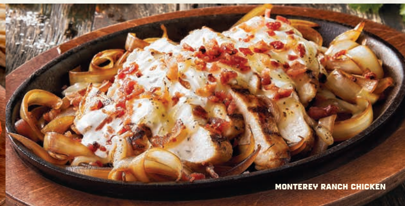
MONTEREY RANCH CHICKEN