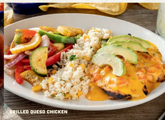
GRILLED QUESO CHICKEN