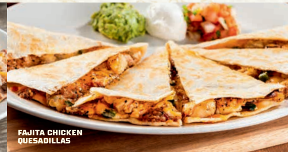
FAJITA CHICKEN QUESADILLAS