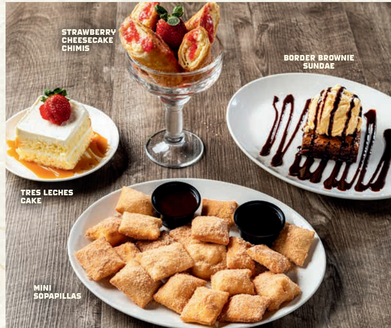
STRAWBERRY CHEESECAKE CHIMIS