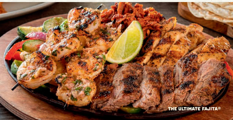
THE ULTIMATE FAJITA®

AMP UP YOUR FAJITAS! ADD A SHRIMP SKEWER 50 cal | 4.99