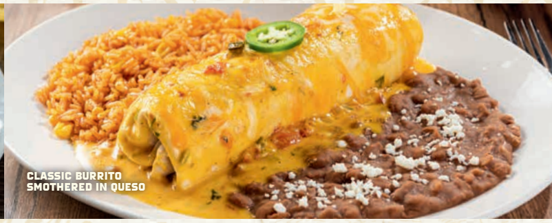
CLASSIC BURRITO SMOTHERED IN QUESO